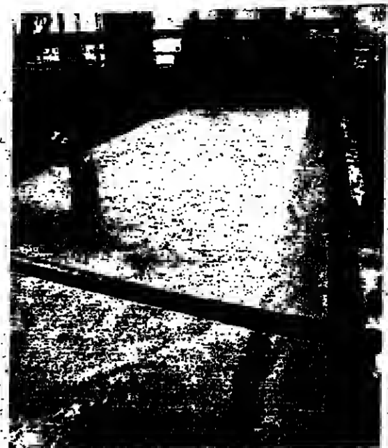
What cheese goes through before it reaches your table (above and left).

When the milk reaches the Tel Yosef plant, it is stored in giant 200,000-litre stainless steel tanks at 4-6°C. It is then pasteurized and curdled to form a smooth curd block in the vat. Curdling is induced with rennet, an enzyme found in the stomachs of calves, which coagulates the milk to separate the curds from the whey. Because rennet should be taken